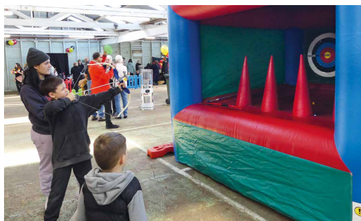
The Fun Zone was a hit with all ages