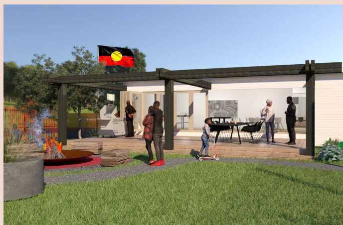
An artist's impression of the new hub