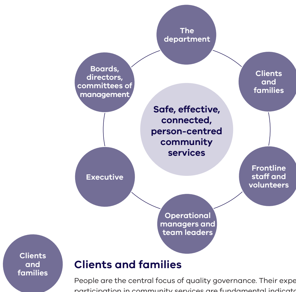
Figure 1: Quality governance roles and responsibilities

Specific roles are highlighted in Figure 1.